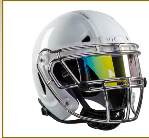
The Zero 1 Helmet From VICIS.