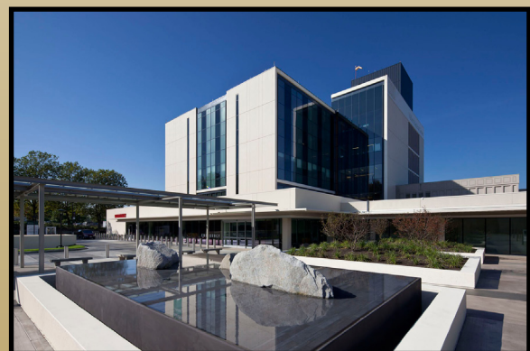
Valley Medical Center