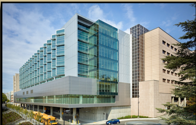
University of Washington Medical Center

Extraordinary scientific achievement and professional leadership are also a hallmark of the UW Department of Neurological Surgery. Among the currently appointed faculty there are a minimum of 189 editorial positions on major journal editorial boards. Faculty members hold leadership positions in approximately 700 major clinical and scientific societies. Our current faculty members have been asked to deliver at least 2,429 invited lectures and have been recognized with at least 616 honors and awards. Four faculty members have lectureships named for them. Seven of our faculty members or resident graduates have become Chairs of other neurological surgery departments, 3 have been associate or assistant deans in academic institutions and 1 was the Dean at UC San Diego.