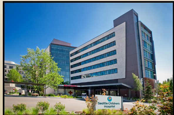
Seattle Children's Hospital