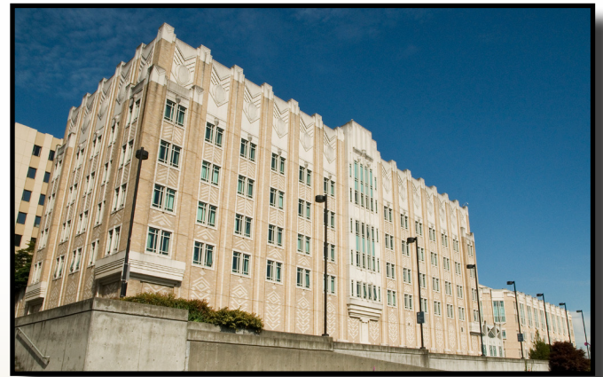
Harborview Medical Center

These accomplishments also denote a department that is world class.