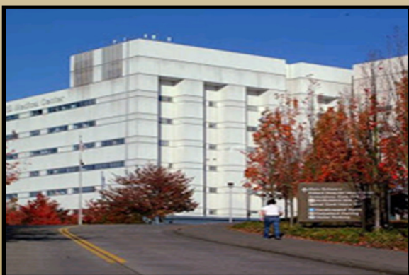
VA Puget Sound Healthcare System