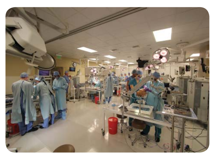
Everyone gets a turn...