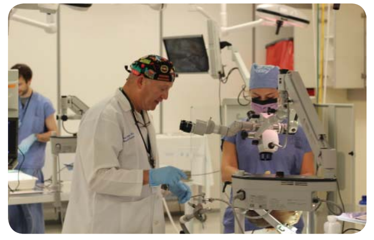
... Even the Boss...

These courses are an invaluable educational opportunity for our residents.