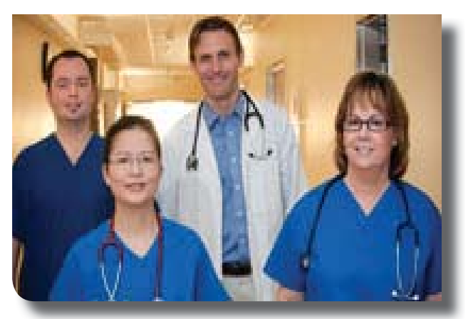
Valley Medical Center

The chief executive officers of UW Medicine and Valley Medical Center (VMC) have announced the formation of a strategic alliance in which Valley Medical Center, Public Hospital District #1 of King County, will join UW Medicine effective July 1, 2011. The creation of this alliance follows several months of in-depth due diligence, discussion with respective boards, communication with key stakeholders, and preparation of a strategic alliance agreement, which was approved by the governing boards of both organizations.